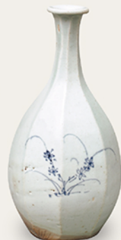
BEVELED BOTTLE, Blue-and-white porcelain with floral plant design Joseon dynasty, first half of the 18th century Gift of SUMITOMO Group, the ATAKA Collection