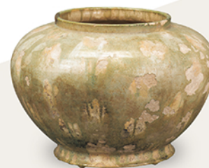
Important Cultural Property JAR, Earthenware with three-color glaze Nara period, 8th Century Gift of SUMITOMO Group, the ATAKA Collection