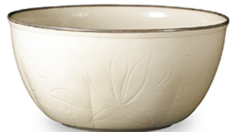
Important Cultural Property BASIN, White porcelain with carved lotus design Northern Song dynasty, 11th-12th century Ding ware Gift of SUMITOMO Group, the ATAKA Collection