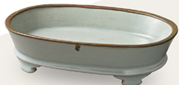
NARCISSUS BASIN, Celadon Northern Song dynasty, end of 11th-early 12th century Ru ware Gift of SUMITOMO Group, the ATAKA Collection