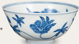
BOWL, Blue-and-white porcelain with aibika(hollyhock) design Ming dynasty, Chenghua mark and period (1465-1487) Jingdezhen ware Gift of SUMITOMO Group, the ATAKA Collection