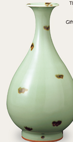
National Treasure BOTTLE, Celadon with iron-brown spots Yuan dynasty, 14th century Longquan ware Gift of SUMITOMO Group, the ATAKA Collection