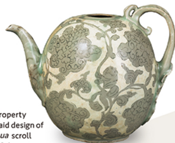
Important Cultural Property EWER, Celadon with inlaid design of boys and baoxianghua scroll Goryeo dynasty, 12th-13th century Gift of SUMITOMO Group, the ATAKA Collection