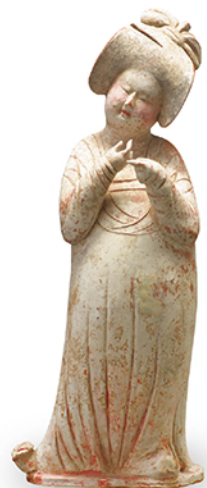
FIGURINE OF A LADY, Earthenware with painted decoration Tang dynasty, 8th century Gift of SUMITOMO Group, the ATAKA Collection