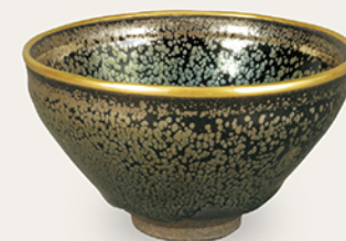
National Treasure TEA BOWL, Tenmoku glaze with silvery spots Southern Song dynasty, 12th-13th century Jian ware Gift of SUMITOMO Group, the ATAKA Collection