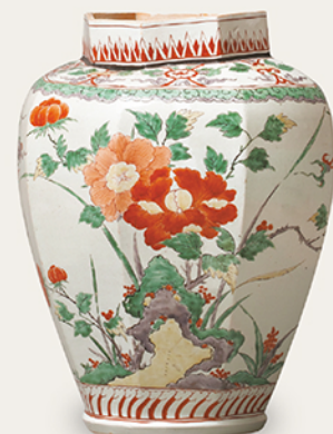
OCTAGONAL JAR, Porcelain with design of peony and camellia in overglaze enamels Edo period, 1680-1710s Arita ware, Hizen