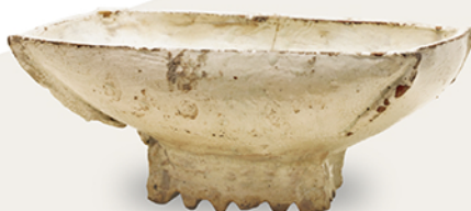
RITUAL VESSEL FU , Buncheong ware with overall slip-coating, ( kohiki ) Joseon dynasty, 15th century Gift of SUMITOMO Group, the ATAKA Collection